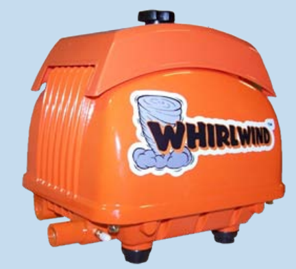
1.7 CFM at 1.9 PSI STA40: STA60N: 2.33 CFM at 2.18 PSI STA80N: 2.83 CFM at 2.18 PSI STA100N: 3.71 CFM at 2.6 PSI